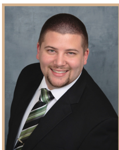
Director of Bands