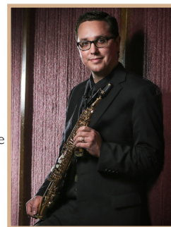
Former Cluster Private Lesson Instructor