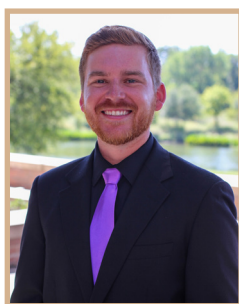
Associate Director of Bands