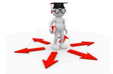
Keller ISD Dual Parent Presentation